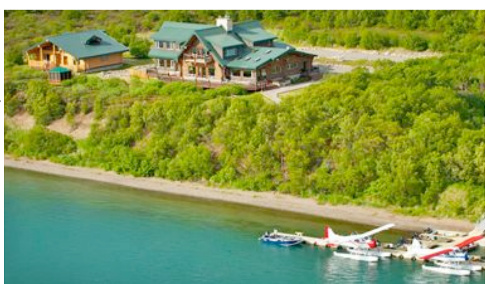
The magnificent Crystal Creek fishing lodge at Bristol Bay.

not only our target silvers and rainbows, but four other species of salmon plus grayling, Arctic char and dolly varden trout. My largest Silver - 35" and just shy of 18lbs. My largest rainbow was 28.5" and 11lbs. Trip was organised via the Orvis Fly Fishing store where I was living in Texas. Travelled with eight folks I knew and it was better than what I had dreamed it would be like since the age of 14 when I saw my first article on Alaskan fishing in Outdoor Life, an American magazine.