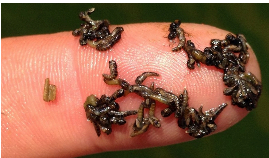
No wonder the fish were on #18 Zebra Midges

After catching a few off this run it was time to haul anchor and scoot a little further upstream to fish a deeper section of river, drifting and casting towards deeper drop offs. Again it didn't take long for the fish to come back on, and TJ did a great job on the ores keeping the boat in position