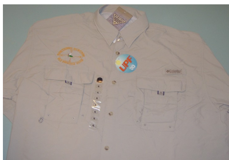
Columbia fishing shirt $70