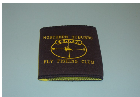
Stubby holder $5