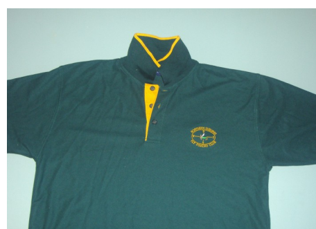
Polo shirt $25