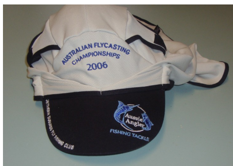
Frill Neck Cap $20