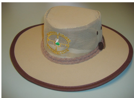
Wide-brimmed hat $20