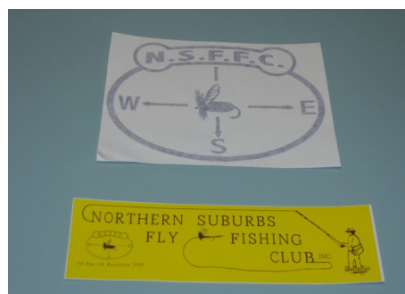
Boat sticker $5, Yellow sticker $2